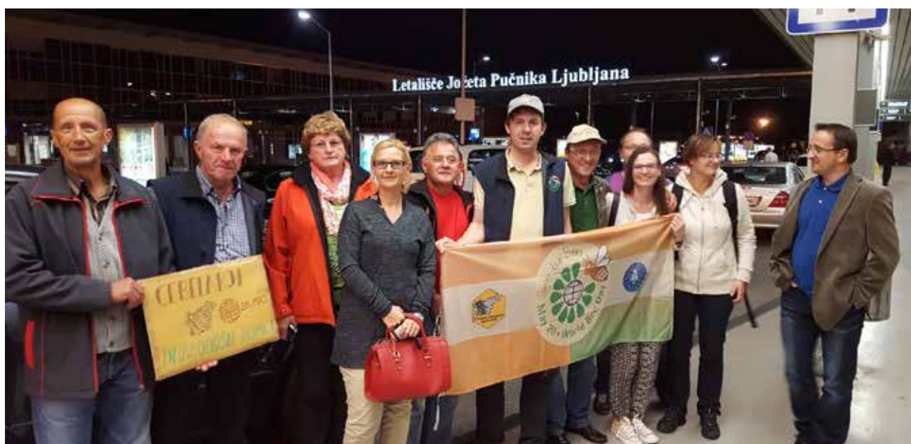
The unforgettable welcome on returning from the Apimondia International Apicultural Congress 2015 in South Korea

The Slovenian public immediately welcomed the idea with open arms and the World Bee Day project became a real movement. A movement for bees, for a green Slovenia, for a clean environment, for locally produced food. In short, the World Bee Day project became about more than just beekeeping.